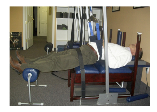
Fig. 4. Lumbar extension traction to increase the lumbar lordosis

The large inferiorly sequestered left posterolateral L4–5 disc herniation extending into the left L5 lateral recess that resulted in compression of the left L5 and left S1 nerve roots.