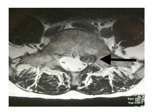
Fig. 3. MR image demonstrating an L4–L5 lumbar disc herniation/sequestration on a coronal slice

The bulging annulus fibrosus at L4–L5, and the inferiorly sequestered disc material.